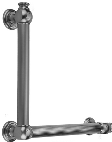
90° GRAB BAR