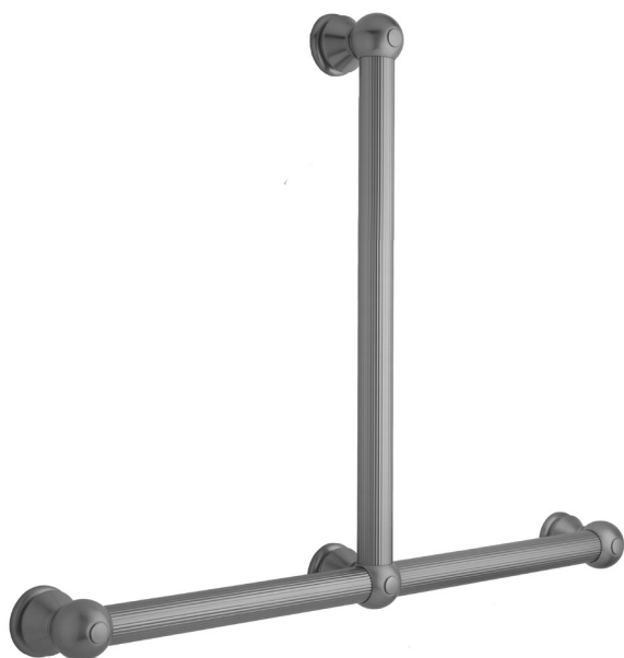
INVERTED "T" GRAB BAR